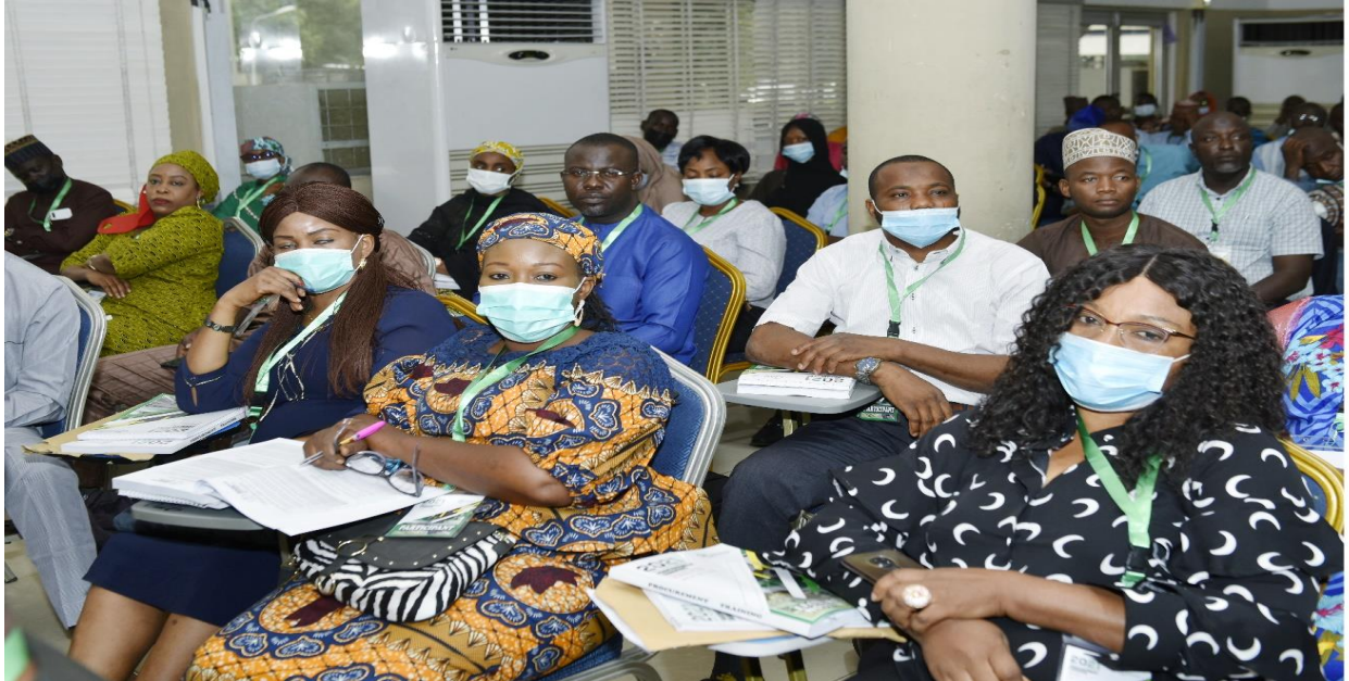
Cross Section of Participants during the 2 nd Batch of Public procurement Conversion for Procurement Officers in Ministries, Departments, Agencies, Parastatals and Commissions of Federal Government at Digital Bridge Institute, Oshodi, Ikeja, Lagos

The representative of the Chairman of the ICPC, Hon. Barr. Obiora Igwedibia, in his Goodwill message, commended the Bureau for coming out with such a programme, stating that, at a time like this when COVID-19 had eaten into the economy of every nation, all hands must be on deck to stabilize the economy and move forward. He declared the training open.